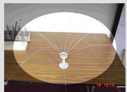
Bird proofing "Daddi Long Legs" system