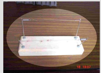
Bird proofing Wire system

The last academic meeting was held on 18 June 2004. We are most honored to have collaborated with Hong Kong Pest Management Association (HKPMA) in organizing this academic meeting.