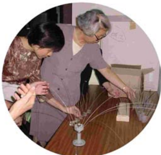
Bird proofing devices