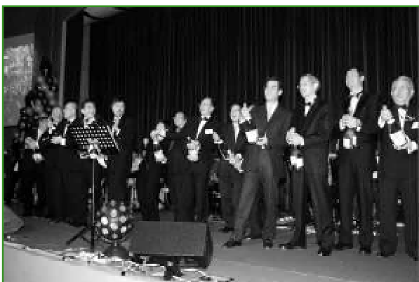
Count down to 2005! Group picture on stage at that special moment between 2004 and 2005.